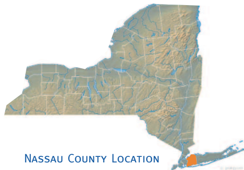
NASSAU COUNTY LOCATION

Welcome to Nassau County! We are a suburban County in the New York Metropolitan Area, adjacent to New York City, in the State of New York. Nassau County occupies a portion of Long Island immediately east of the New York City borough of Queens. It is divided into two cities and three towns, the latter of which contain numerous villages and hamlets. As of the 2000 census, the population was 1,334,544. The County legislature has 19 members. Nassau County government consists of multiple departments working together to provide quality services to its constituents. The Probation Department is an integral part of our law enforcement community that ensures the safety and quality of life for each and every Nassau County resident. Nassau County continues to have one of the lowest crime rates of any municipality with a population of over 1 million people.