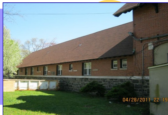
Jones Manor after renovation