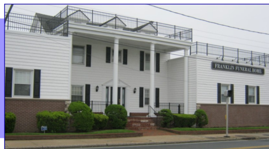
Franklin Funeral Home-Franklin Square