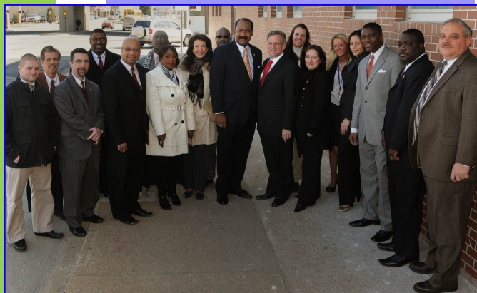
County Executive Ed Mangano poses with Mayor Hardwick of Freeport along with Nassau County Staff and CDA Staff of Freeport

Nassau County Executive Edward P. Mangano places priority on projects that create jobs and spur economic development. The project now underway at 3 North Main Street in Freeport is a total rehabilitation of the building that will house the “Main Street Dialysis Center”. This new office suite is expected to bring 30-40 new jobs to the Village of Freeport and Nassau County. Nassau County has provided CDBG funding for the renovation of the façade of the building and the installation of an elevator for handicap accessibility. The Dialysis Center is expected to be completed in early spring 2012.