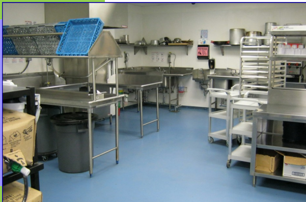
State of the Art Kitchen