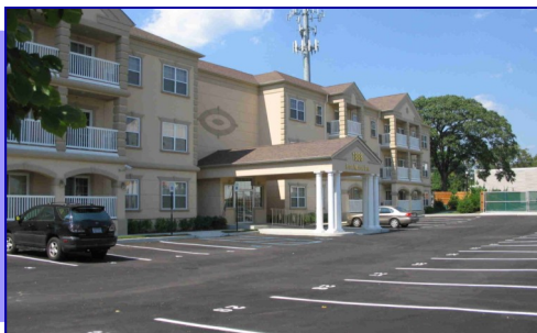
Elmont Golden Age Housing