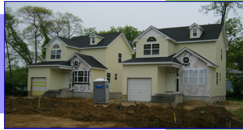
Roosevelt, New York

Affordable housing projects are taking place throughout Nassau County. In an effort to address blighted conditions, Nassau County consortium members have been acquiring blighted properties in order to redevelop and build affordable housing units. Currently, the Roosevelt Scattered Site project is in full construction mode. Six new homes will be completed by summer 2011 and will be sold via a lottery system targeting low/mod income first-time homebuyers.