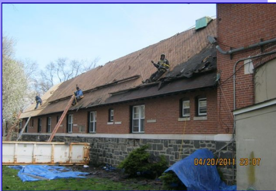
Jones Manor renovation