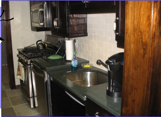
Bellerose senior center new kitchen