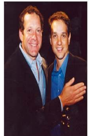
STEVE GUTTENBERG (POLICE ACADEMY) RALPH MACCHIO (THE KARATE KID)