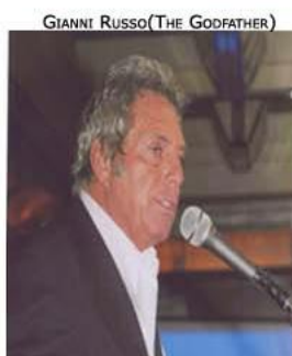
GIANNI RUSSO (THE GODFATHER)