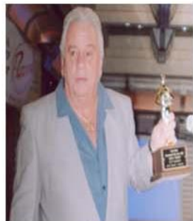
VINNIE VELLA (THE SOPRANOS)