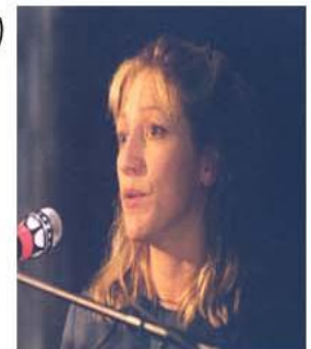
EDIE FALCO (THE SOPRANOS)