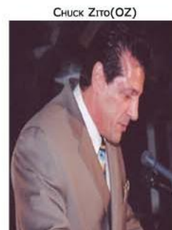
CHUCK ZITO (OZ)