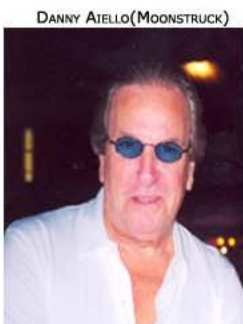
DANNY AIELLO (MOONSTRUCK)