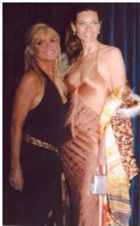
CATHERINE HICKLAND (ONE LIFE TO LIVE) CAROL ALT (SUPERMODEL)