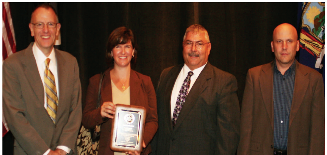
BAND receives the Governor's Award for Excellence in Emergency Management:

And, looking to the future 3.0 is on the drawing board because you can't solve tomorrow's problems with yesterday's technology.