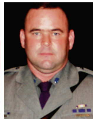
Edward F. Jacoby, Jr. Memorial DPC Award