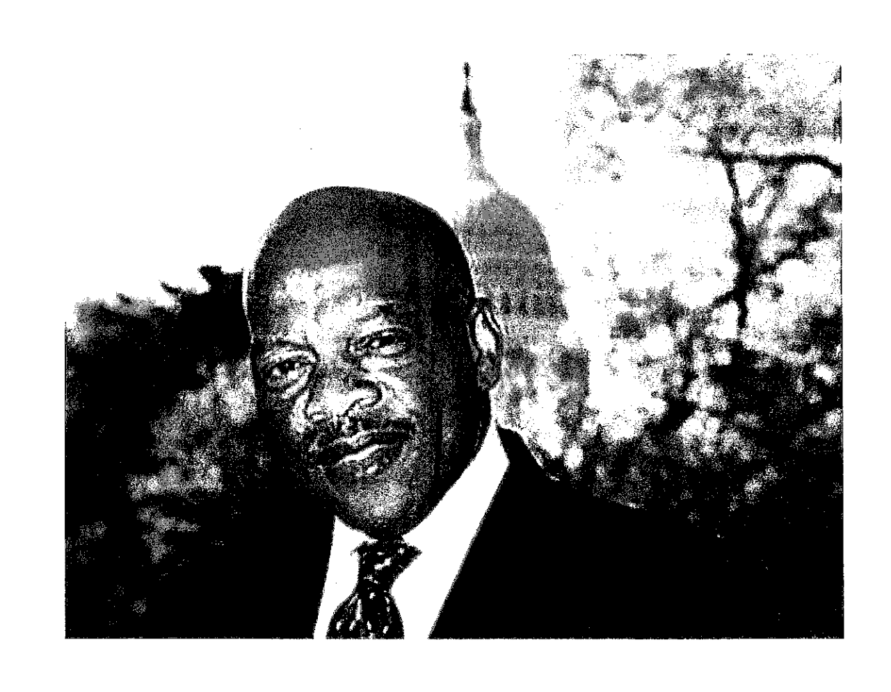
JOHN R. LEWIS VOTING RIGHTS ACT OF NEW YORK