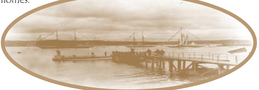
Long Island Sound, Oyster Bay, c.1900s

also brought tourists to the beautiful seaside. Waterfront communities such as Sea Cliff, founded as a Methodist camp meeting ground, blossomed. The wooded North Shore attracted prominent New Yorkers to establish vacation homes.