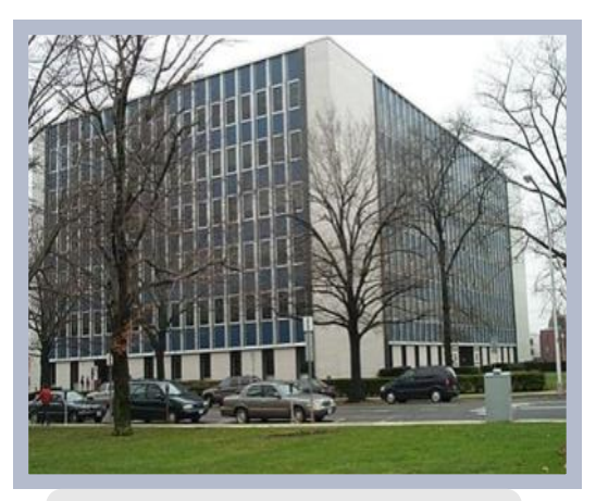
Office of the Nassau County Clerk 240 Old Country Road, Mineola