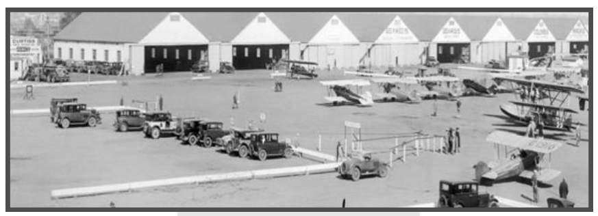
Roosevelt Field, 1928