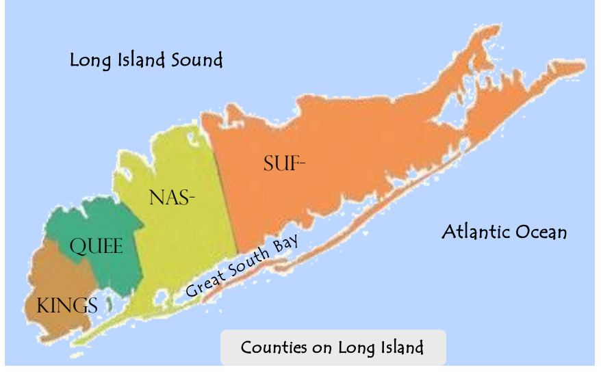
On January 1st, 1898, all the western towns in Queens County became part of New York City. The eastern towns--Hempstead, North Hempstead, and Oyster Bay--were excluded from Greater New York but remained part of Queens County.

In 1683, Long Island was divided into three counties: Kings, Suffolk, and Queens. Queens County included western Long Island, as well as the present day towns of Hempstead and Oyster Bay. The towns grew slowly as quiet farm lands through the early 1700's, although its plains provided ideal sites for colonial horse racing tracks.