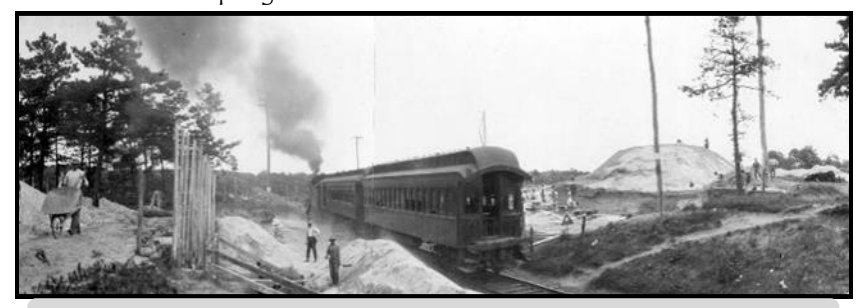
Central Ave Bethpage bridge construction, Vanderbilt Cup Races, 1908

Station in the heart of Manhattan. The population of Nassau's small villages along the railroad lines swelled with commuters, leaping from 55,448 in 1900 to 303,053 in 1930.