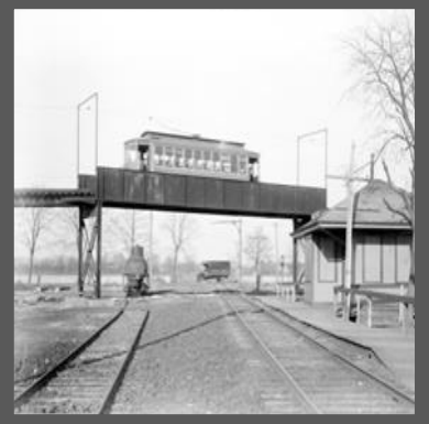
West Hempstead Trolley, area of Hempstead Ave, 1920