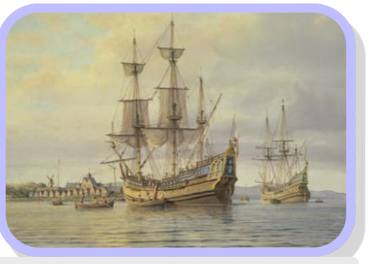
Dutch Settlers, Long Island Sound, c.1600s

town of Southampton. Three years later, on December 13, 1643, another band of adventurous New Englanders crossed the Long Island Sound from the Connecticut t o w n s o f Wethersfield and