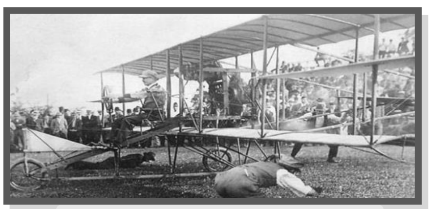
Curtiss Biplane taking off from Hempstead Plains, 1920