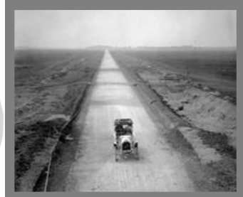
Vanderbilt Cup Race Carman Ave, East Meadow Early 1900s