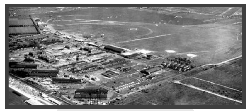
Aerial view of Mitchel Field c.1931

aviation, and nearby Mitchel Field, a major army air base.