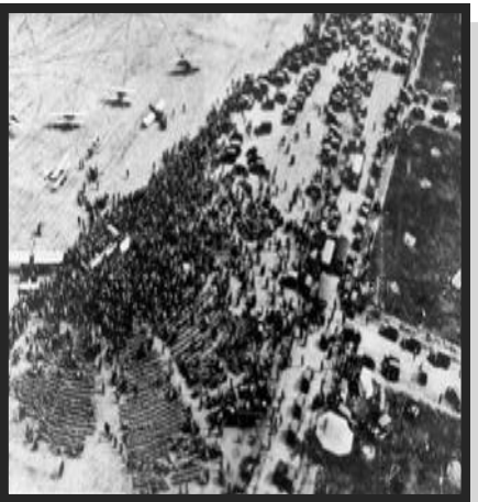
Fitzmaurice flying field Massapequa Park, 1929