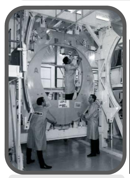
Grumman, Bethpage, Technicians at work on a Lunar Modular