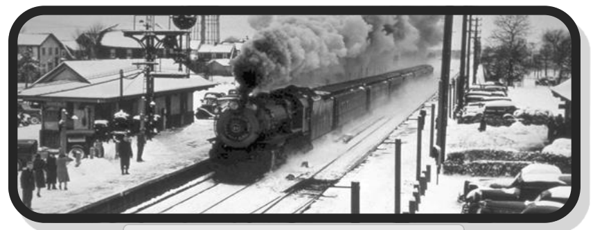
Mineola Train Station, 1940