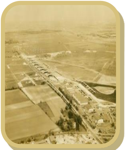
Aerial view of Roosevelt Field c.1931

nationally significant airstrips: Roosevelt Field, a center of civilian