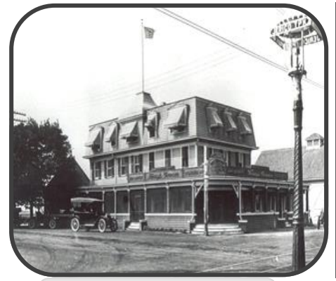
Jericho Tpke & Willis Ave, Mineola, 1920