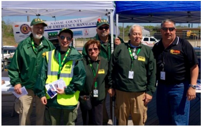
CERT Members in action at the 2015