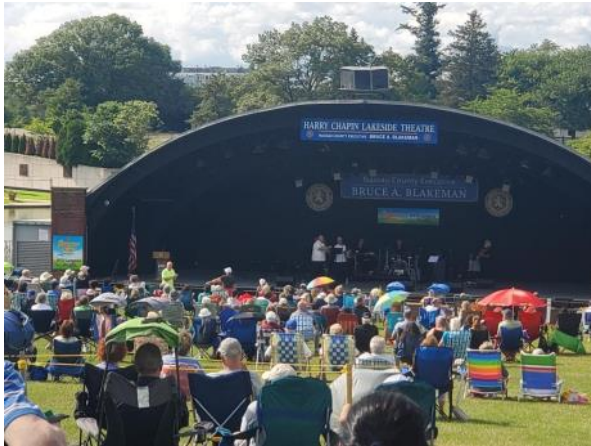
Monday Evening Concert at Eisenhower Park on July 10th with the Classics of the Fifties & Sixties