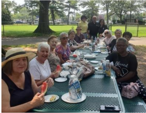
North Merrick Senior Center enjoying lunch during Noontime Concert Series at Eisenhower Park