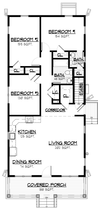
FIRST FLOOR PLAN SCALE: N.T.S. BUILDING : 1,341 SQFT. COVERED PORCH : 188 SQFT. TOTAL AREA : 1,538 SQFT.