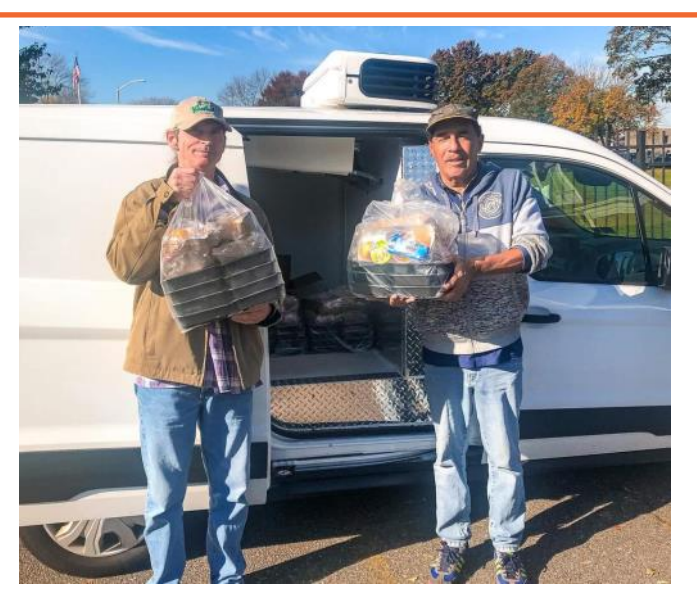
Catholic Charities Home Delivered Meals Drivers brought Thanksgiving meals to homebound seniors. No one deserve to go hungry, especially not during the holiday season.

slowly over time, therefore its important to get screened regularly to support your health. Medicare part B covers Pap tests, pelvic exams and clinical breast exams. You can learn more about Medicare's preventive services by visiting Medicare.gov or by calling HIICAP at (516)485-3754.