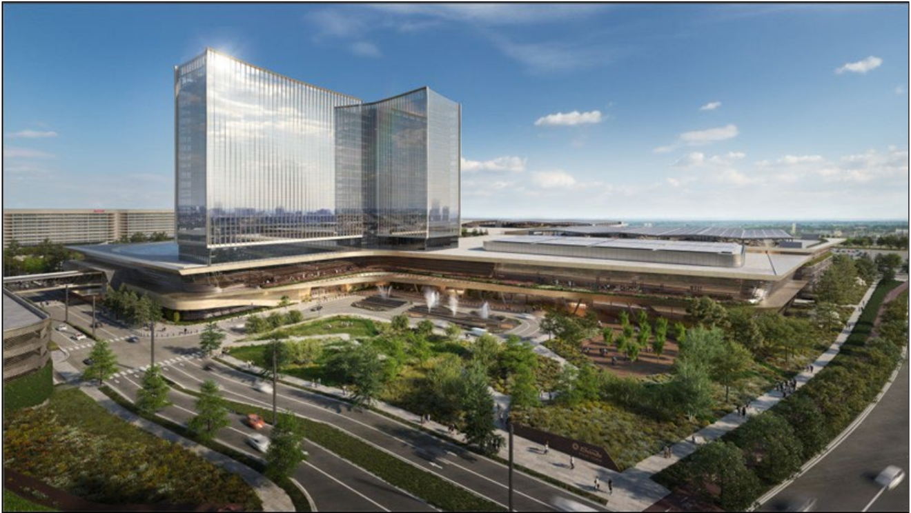
3) Same viewpoint as no. 2, during daytime conditions.

1255 Hempstead Turnpike and 101 James Doolittle Boulevard, Uniondale, Town of Hempstead, Nassau County