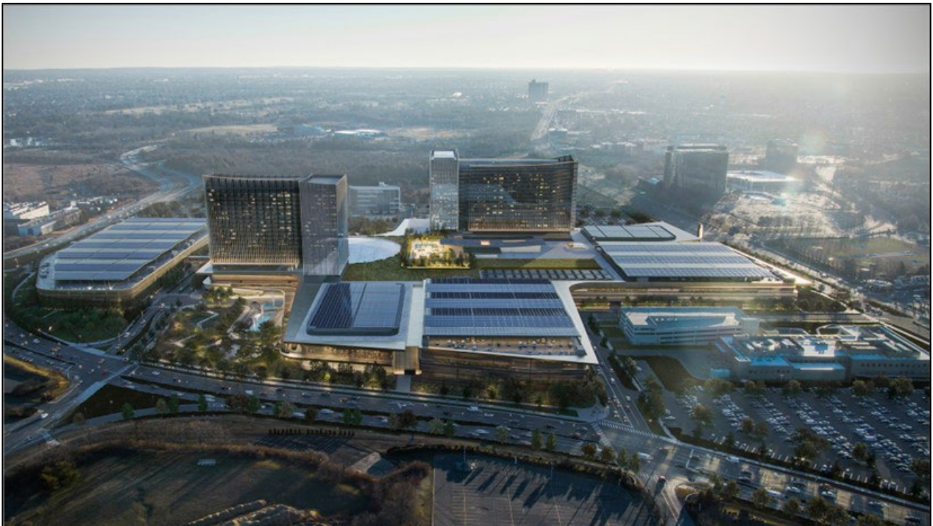
4) View facing east from above Earle Ovington Boulevard toward the overall Integrated Resort and its surroundings.