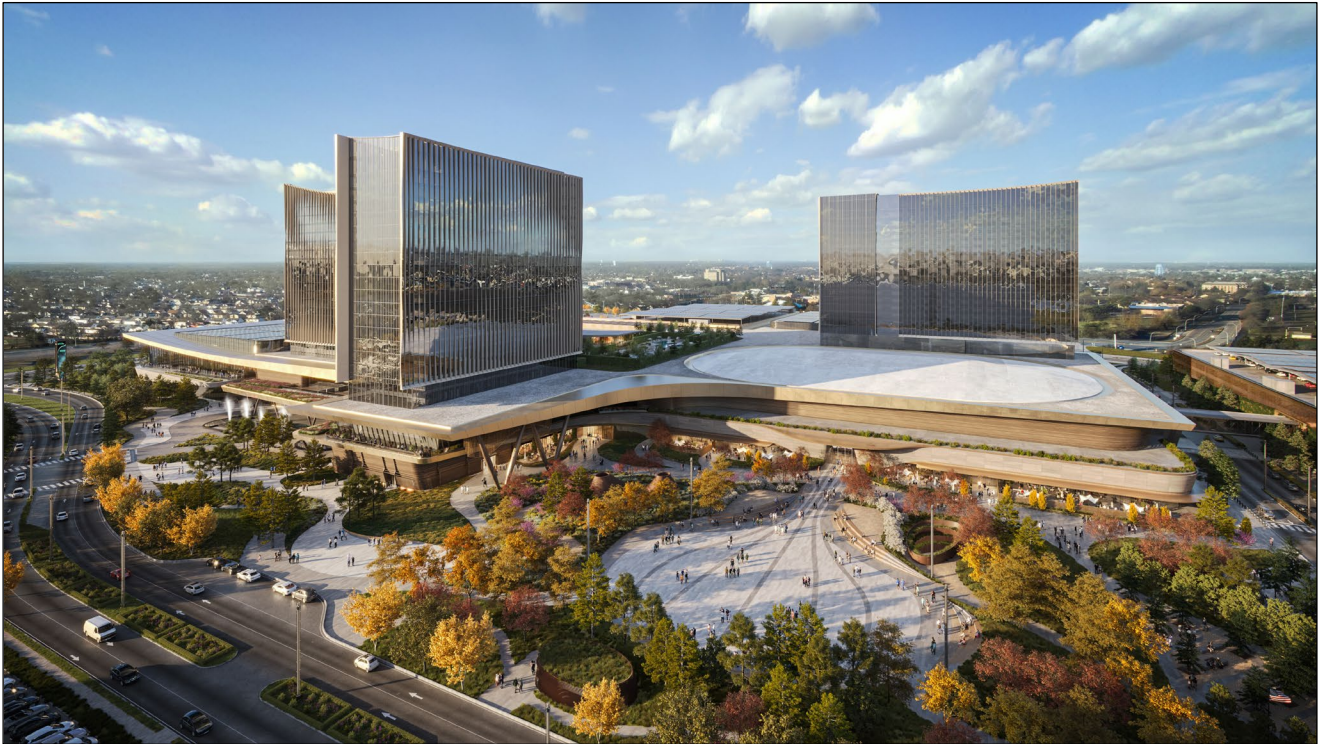
1) View facing west from above Sands Boulevard toward the Central Plaza, with the Hotel Tower 1 visible at left, Hotel Tower 2 visible at right, and the gaming and parking facilities surrounding.

1255 Hempstead Turnpike and 101 James Doolittle Boulevard, Uniondale, Town of Hempstead, Nassau County