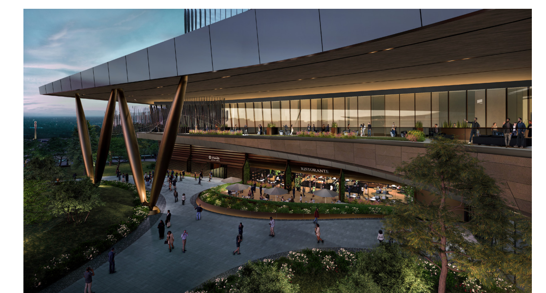
View of Landscaped Terrace