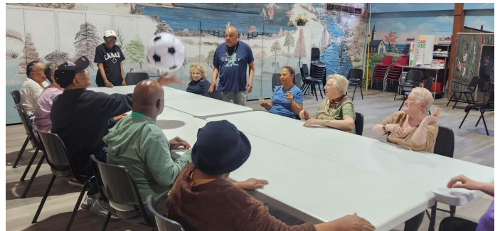
Oyster Bay Senior Center celebrated its volunteers with a Volunteer Luncheon!