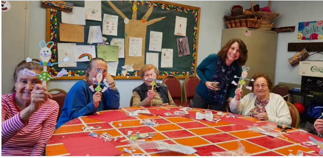
Easter Crafts and celebrations at the Wantagh Senior Center