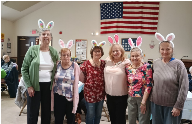
Easter Celebration at the Hispanic Brotherhood in Hempstead