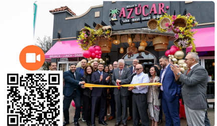
Grand Opening: Azucar in Massapequa