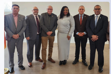
C3 Workshop Panelists at the Yes We Can Community Center