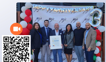
3 rd Year Anniversary: Mojo in Rockville Centre