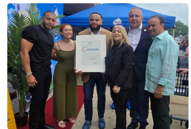
Grand Opening: Shop Fair Supermarket in Hempstead