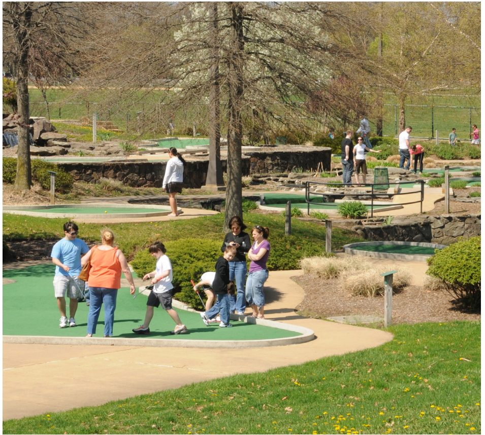
FAMILIES ENJOYING MINI GOLF AT EISENHOWER PARK