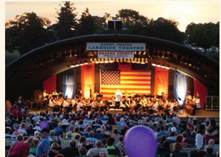
NASSAU COUNTY SUMMER CONCERTS AT LAKESIDE THEATRE

The fun kicks off in June with our International Music Nights Concert Series at the Harry Chapin Lakeside Theatre in Eisenhower Park. Watch history come to life at Old Bethpage Village Restoration as you take in a game of Old Time Baseball, or a Mounted Cowboy Shooting Match.